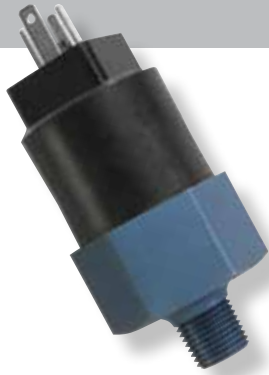
Shown with HP electrical option