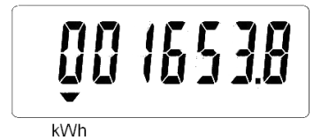
Cumulative Energy Register

Energy Produced Over 24 Hour Period - 4.1kW